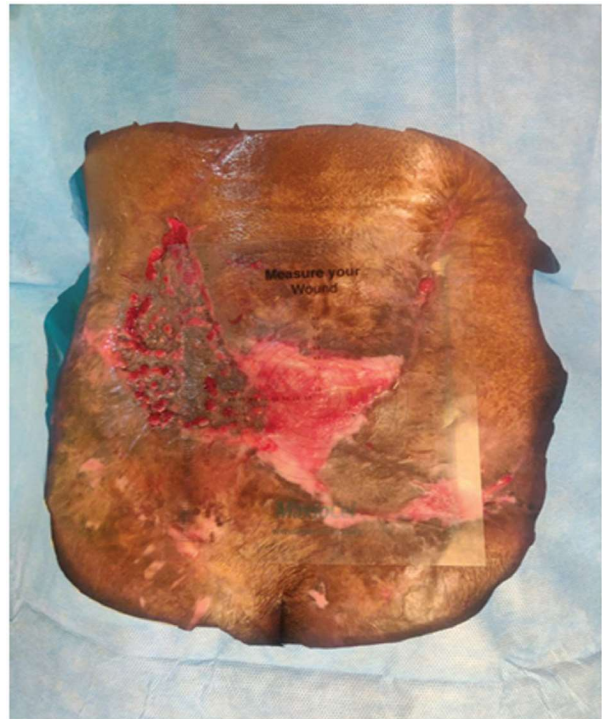
Fig. 2: Measurement of the wound with the stencil

routine investigation, the patient underwent a CT Dorsolumbar scan to rule out osteomyelitis. The ulcer on the back was excised and sent for histopathology to rule any malignant aetiology. After ruling out malignancy, patient underwent transposition flap for the raw area post excision. Post transposition distal part of the flap underwent necrosis for which debridement was done. The raw area post debridement was planned for further procedures for wound cover. The raw area was measured with the help of stencil (figure 2) with the markings in the X and Y axis and circular markings in the stencil will help in measuring the circumference of the irregular wound. The cost of the stencil is 200 Indian rupees easily available in all stationeries in Indian market.