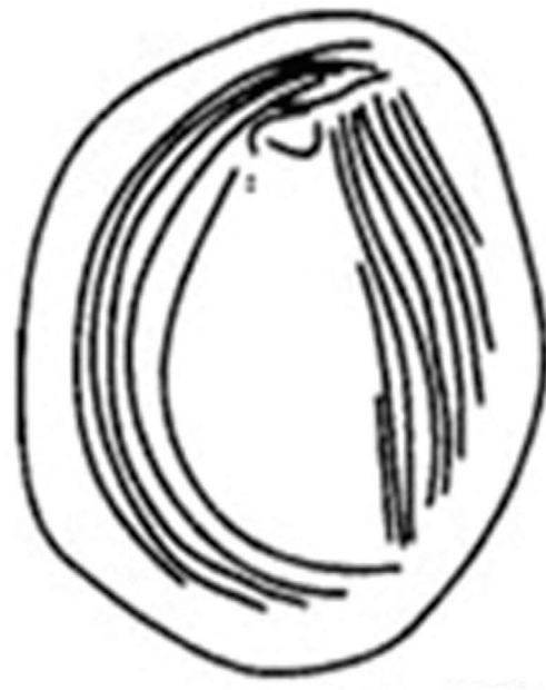
Fig. 1: (b) Line diagram of Chilodonella hexasticha