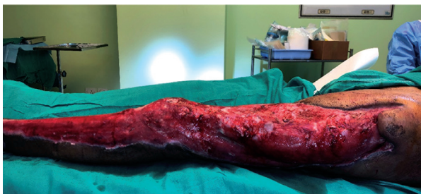
Fig. 10: Healthy wound bed