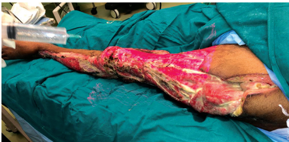
Fig. 4: 25 % Dextrose as prolotherapy.