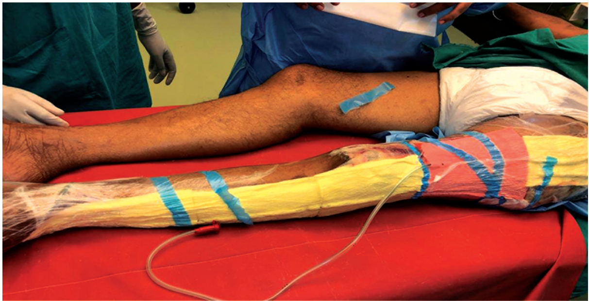
Fig. 9: Negative pressure wound therapy.