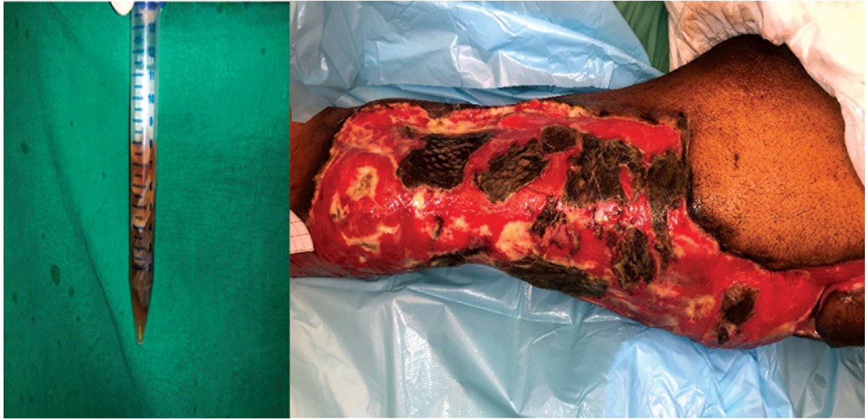
Fig. 8: Allograft application.