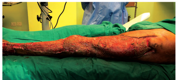
Fig. 11: Split skin grafting done