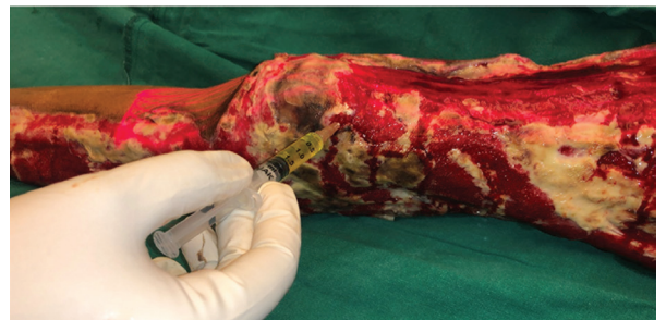
Fig. 5: Autologous Platelet Rich Plasma (APRP).