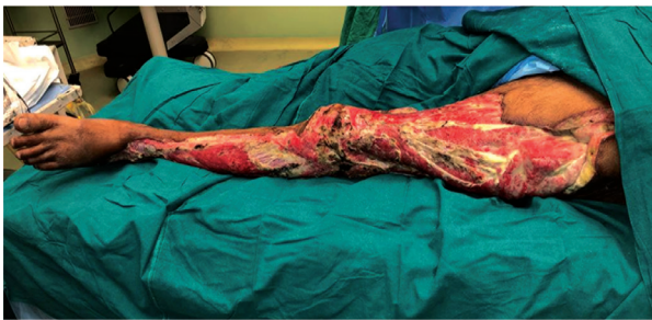
Fig. 2: Wound at Presentation.