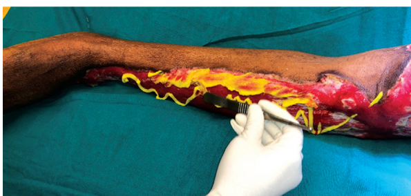
Fig. 6: Sucralfate application.