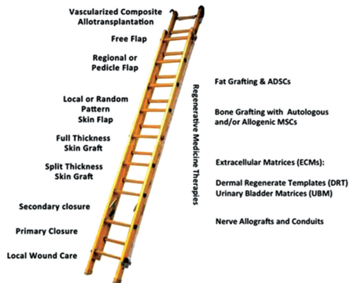
Fig. 1: Hybrid reconstruction ladder.