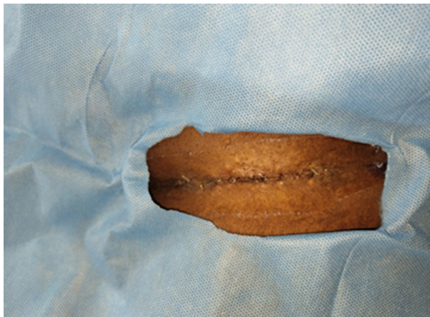
Fig. 1: Donor site skin closure