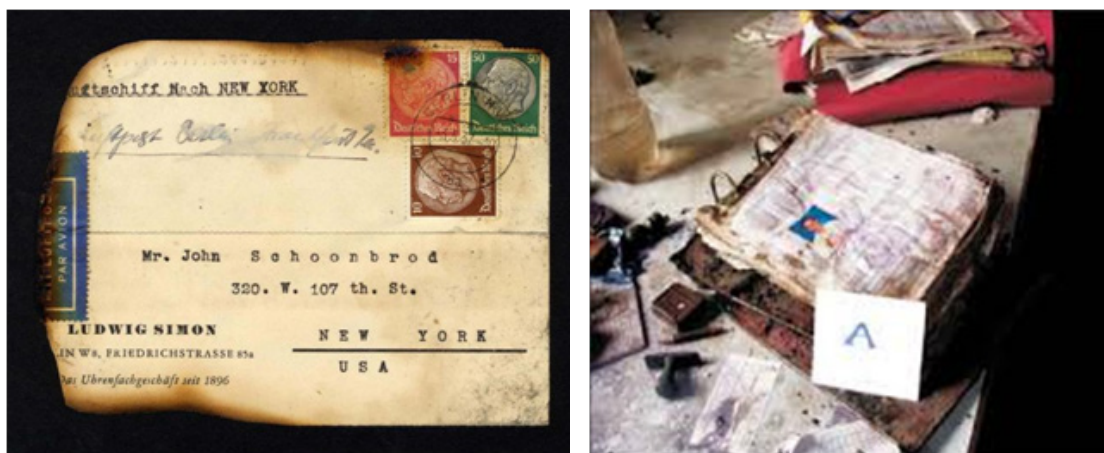
Figure 1: Showing a sample of some of the charred documents

charred documents are supposed to be found, at crime scene, their handling and all the related information up to their forensic examination & the tools and techniques have been reviewed in this paper.