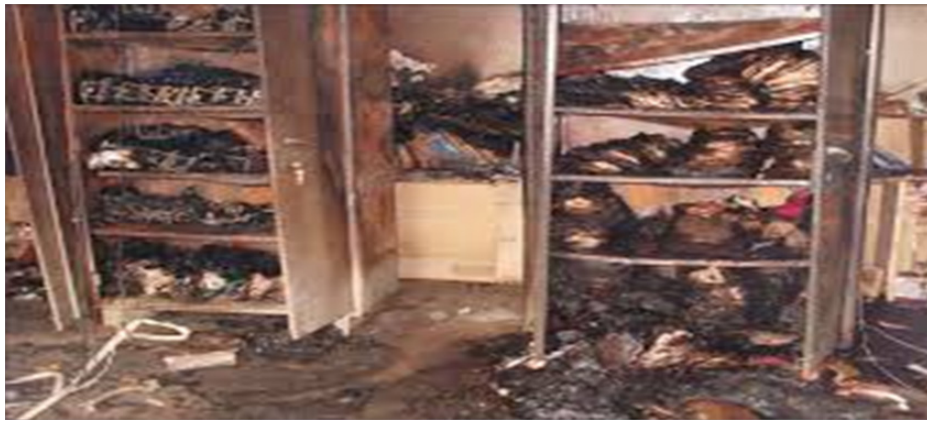
Figure 2: Showing the charred documents found at the scene of crime