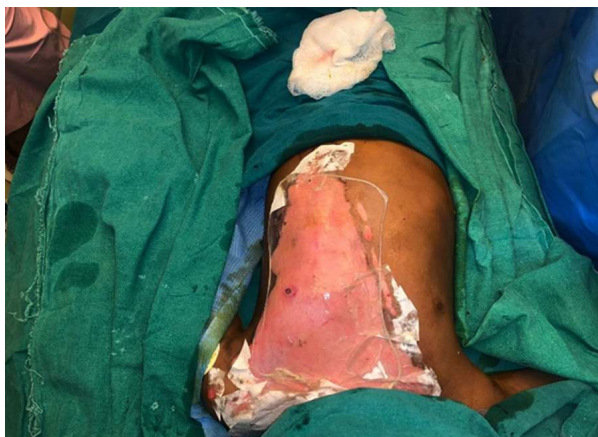
Fig. 5: Application of collagen scaffold dressing