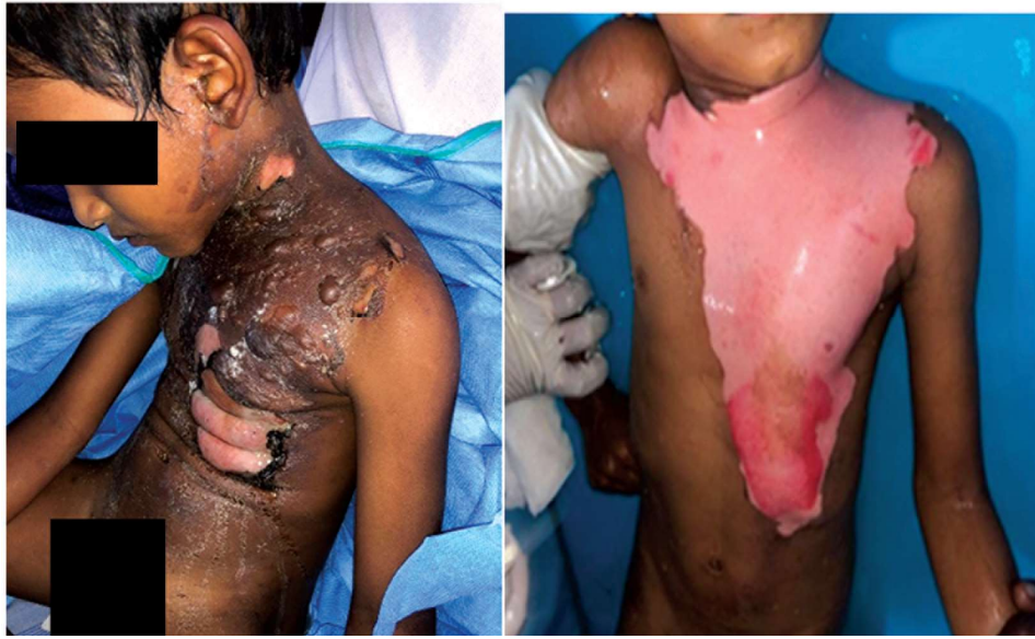
Fig. 2: At the time of presentation