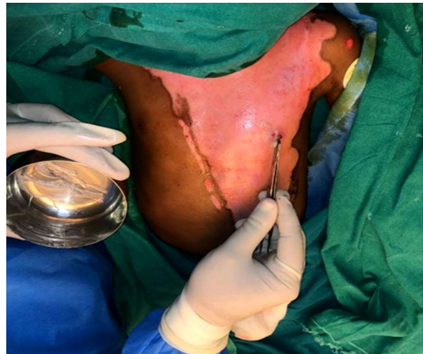
Fig. 4: Application of non-cultured keratinocyte graft (NCKG) over the non-healed areas on day 8