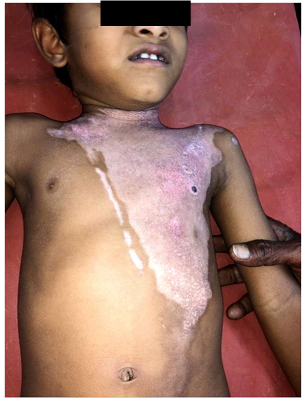
Fig. 8: Healed burn wounds at the time of discharge.

LLLT stimulates tissue regeneration, wound healing, and repair in addition to having analgesic and anti-inflammatory properties. 10 At the cellular level, LLLT promotes cell regeneration, increases collagen production, reduces the development of fibrous tissue, decreases oedema, increases growth factor synthesis, reduces the number of inflammatory cells, reduces the synthesis of inflammatory mediators like substance P, bradykinin, histamine, and acetylcholine, and stimulates the production of nitric oxide. The photobiological effects are influenced