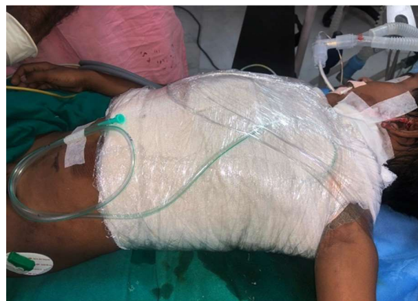
Fig. 6: Negative pressure wound therapy