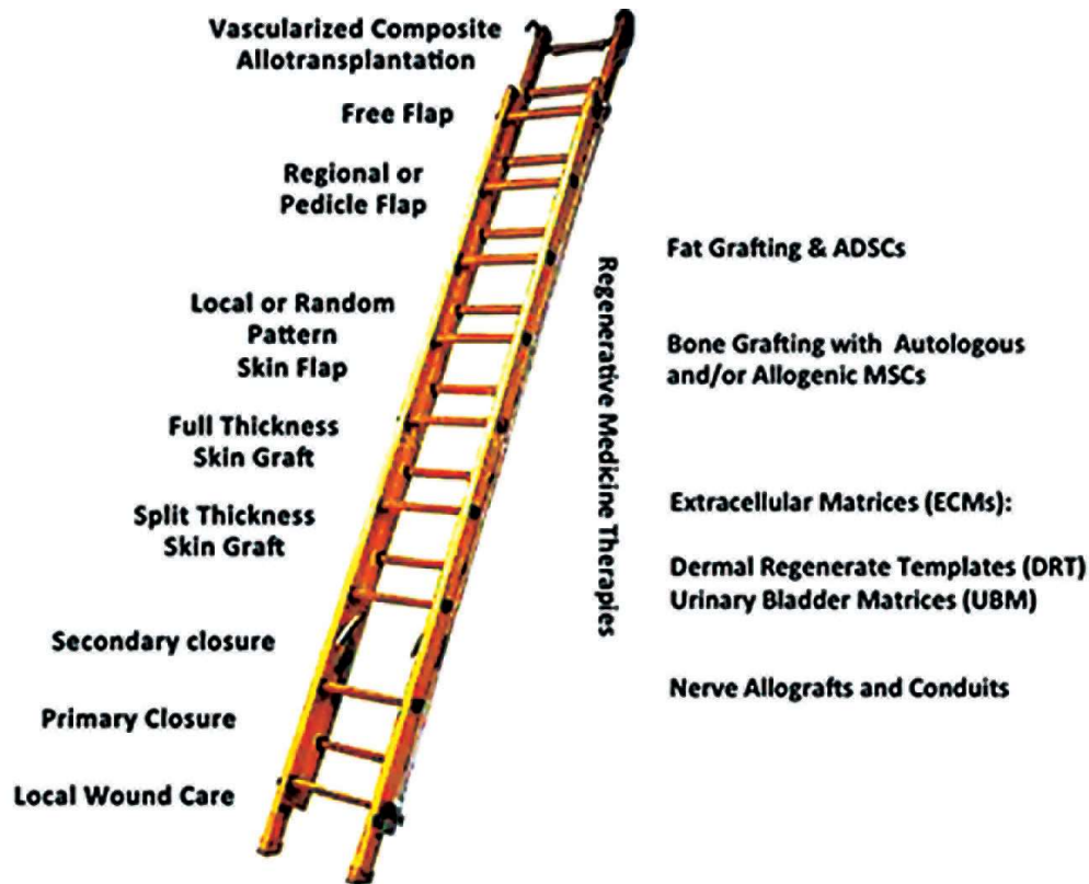
Fig. 1: Hybrid reconstruction ladder

The superficial second degree burn wounds recovered quickly. Patient was successfully discharged, and all burn injuries had entirely