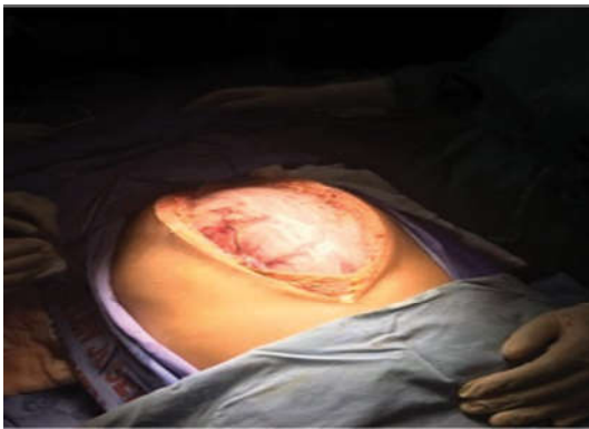
Fig. 1: A view of the exposed abdomen highlighting the abdominal distension.

admission in hospital. The deceased had a chronic illness that was not diagnosed for 9- years. If she were diagnosed early, there was good chance that the patient could have survived. It was a preventable death. 10 Generally, Hirschsprung's Disease is a congenital condition that usually affects neonates who cannot pass stool in the first 24-48 hours. 11 This is due to the failure of ganglion cells to descend during embryogenesis around the 12th to 14th week. 11 Sometimes, when Hirschsprung's disease is limited, and involved to a small segment of bowel, then it can delay in manifestation such as teen years and early adulthood. 11 The preferred first diagnostic procedure is a contrast enema which could be performed at a primary health care setting. This will define the transition zone between normal (dilated) bowel and narrow segment of gut. This transition zone is seen in 70-90% of cases. 12 The gold standard of diagnosis is rectal biopsy. It is possible to obtain a sub mucosal rectal suction biopsy even without any anesthesia. 13