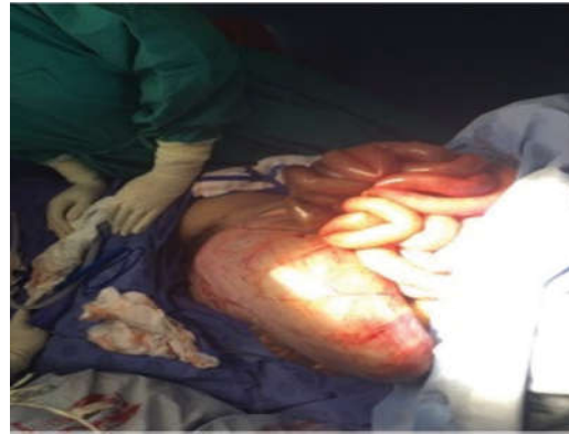
Fig. 3: Distended large bowel seen at laparotomy.

The stool collected during autopsy weighed about 5 kg, rock hard and impacted the distal gastrointestinal tract (Photograph 1, 2 & 3). Abnormal dilation of the distal part of gut can develop from a range of disease processes. NM was not died in operation theatre, it may not be fault in category of deaths because of procedure, and therefore, it was not mandatory to carry out a forensic autopsy. Certain deaths that might have been considered natural in the past must now be classified as unnatural. 8 Very few doctors know or understand the acts and regulations governing their professions, having had minimum exposure to them during undergraduate training. 8