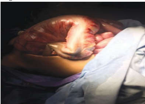
Fig. 2: A view of the distended bowel seen following the