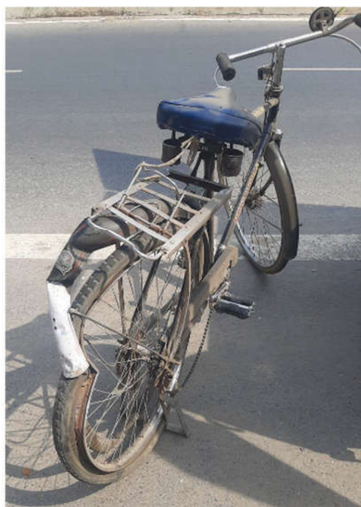
Fig. 5: Damaged back of bicycle.

Crime scene photographs were analyzed and crime scene examination was done which