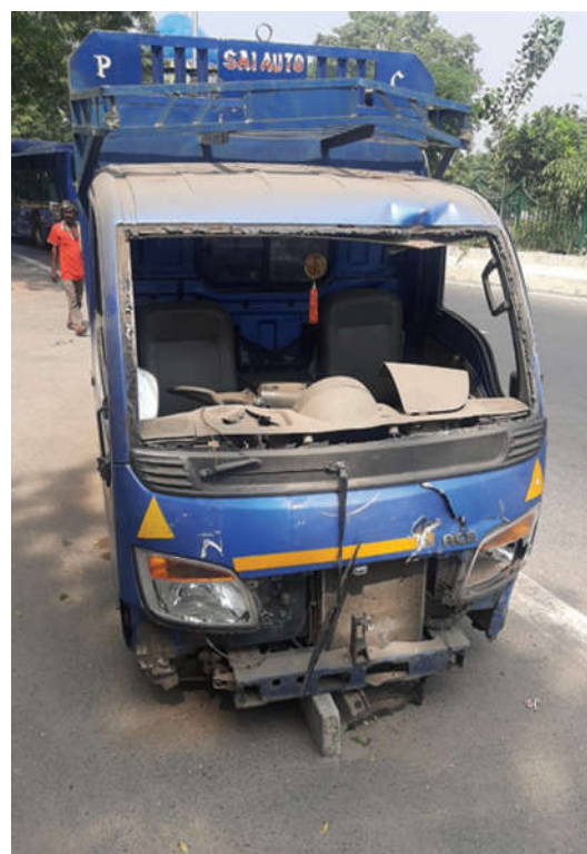
Fig. 6: Damaged front of mini truck.

were consistent with the given history and the postmortem findings. The victim was recovered from the base of a street light pole (Figure 4). The back portion of the bicycle was badly damaged (Figure 5) and the front wheel of the mini-truck was seen dismantled from the main truck and the front part of the truck was damaged (Figure-6).