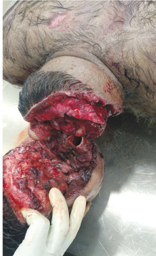
Fig. 2: Near-total Decapitation at atlanto-occipital joint.

the scalp. Multiple abraded contusions were present over the face, both arms, and elbows. On opening the scalp, diffuse subdural and subarachnoid hemorrhage were present.