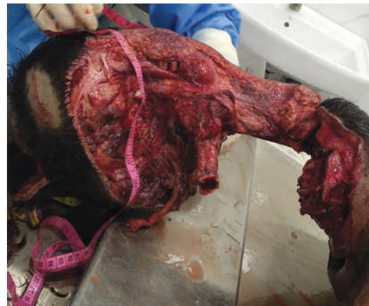
Fig. 3: Near-total decapitation.

Hemothorax was present and all the organs were pale. The cause of death was given as Traumatic decapitation due to blunt force/surface impact.