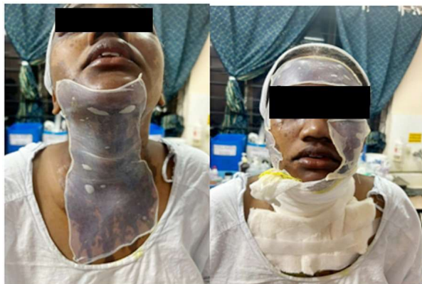
Fig. 2: Collagen Application

Regenerative therapies like collagen scaffold application, feracrylum, , Low Level Laser Therapy Autologous Platelet Rich Plasma, Regenerative Scaffold, Negative Pressure wound therapy (Fig. 2-7).