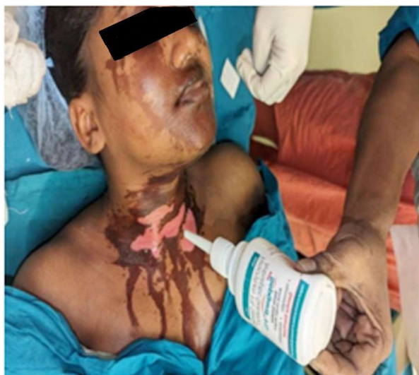
Fig. 3: Feracrylum 1% in Burn wounds