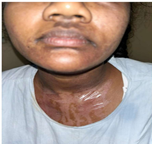
Fig. 9: Silicone sheet application