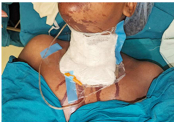
Fig. 7: Negative Pressure Wound Therapy