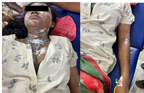
Fig. 1: Alkali Chemical burns at presentation

This study was conducted in the Department of Plastic Surgery in a tertiary care center in South India after obtaining the departmental ethical committee approval. Informed written consent was taken from the patient. 23-year-old female Patient had alkali burn injury when accidental splash of disinfectant in restroom wherein she sustained injuries to face, eyes and chest. (Fig. 1)