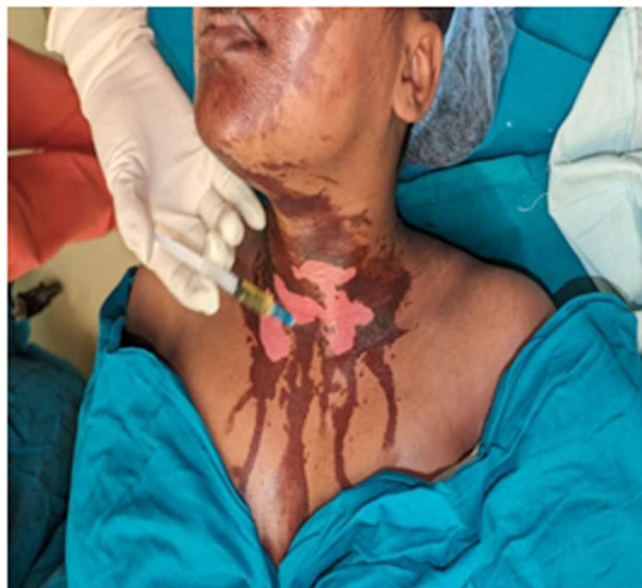
Fig. 5: Autologous platelet rich plasma therapy