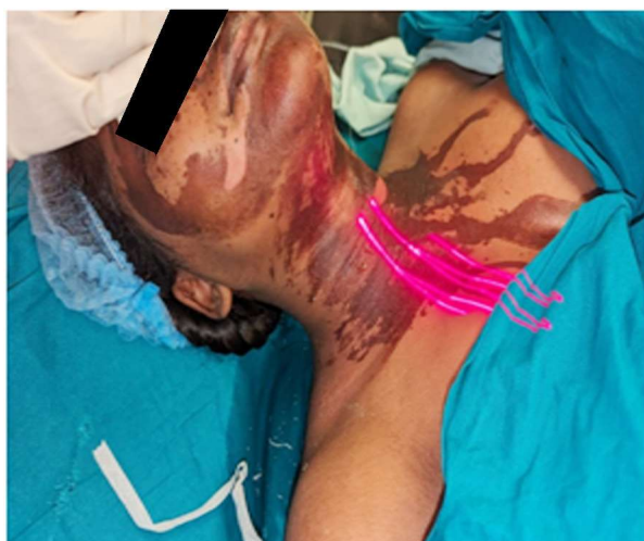
Fig. 4: Low level laser therapy for the burn wound