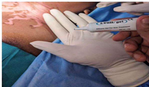
Fig. 8: Silicone gel application for scar

also used low-level laser therapy and autologous platelet rich plasma for scar management. (Fig. 10 and 11)