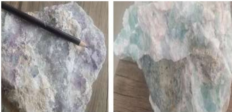
Fig. 1: Fluorine samples in the site.

Some of the countries in which it was issued: England, Switzerland, the United States, Australia, Germany, Mexico, Norway and China. 8