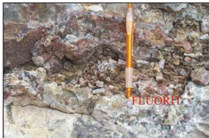
Fig. 2: Appearance of fluorites in the site. 7

Fluoride is very common in nature (Fig. 2). Fluoride is present in various minerals (Florspar, Fluorapatite, Cryolite, Mica, Topaz, Hornblende, Tourmaline), bones and teeth, waters and various biological materials. Aluminum facility, phosphorus fertilizer factories, brick, tile, and ceramic producing industrial zones, especially in the air, soil and water can be harmful to environmental health levels of fluoride. 9 The concentration of fluoride in surface waters is generally between 0.01 and 0.3 ppm. The concentrations of fluoride ions in groundwater depend on the geological, chemical and physical characteristics of the aquifer, the porosity and acidity of the soil and rocks, the