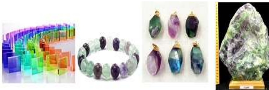
Fig. 3: Use of fluorite as ornaments

Fluorite was used to ensure low sintering in cement construction. However, it has been abandoned in many places since it has corrosive activity in the furnace. 6,7