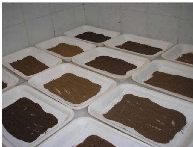
Fig. 3: A photograph of the soil samples drying in the laboratory.

sieve first and cleared from coarse-grained rock fragments and plant remains. It was then brought to the laboratory and dried at room temperature (Fig. 3).