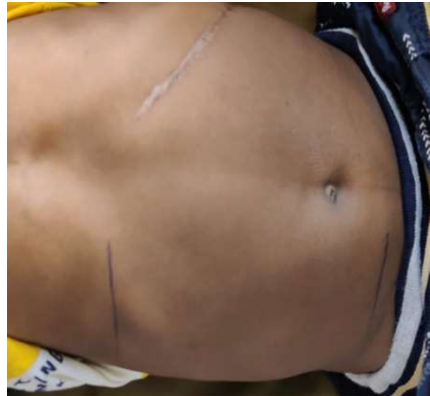
Fig 1: Photograph showing the massive Liver on the right side of the body and splenectomy scar on left side of the body.

Child was started on oral feeds. Chelation therapy was restarted and serum Ferritin was repeated, which came down to 16,072 ng/ml. As patient was hemodynamically stable, he was shifted to oral dexamethasone and referred to gastroenterologist for further management of HCV and advised to