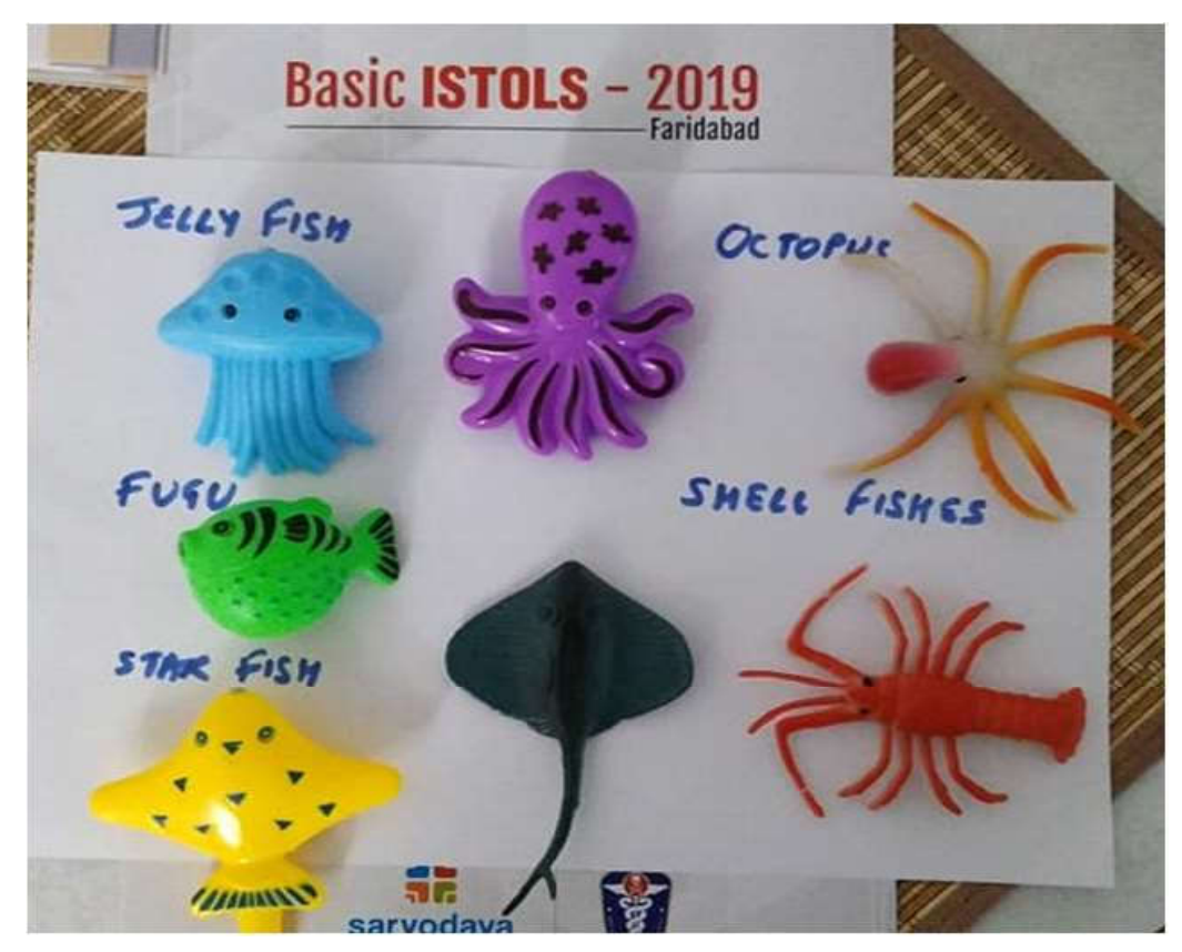
Fig. 5: Marine envenomation teaching by venomous fishes, Fugu, Sting Ray, Star fish with sting, Jelly fish with tentacles, Blue-ring octopus, shellfish and non-venomous Octopus, scenarios simulated by similar look alike toys, thus learning Toxicology in non-toxic manner

On 29th July 2019, in Sarvodaya Hospital, Faridabad, we have conducted ISTOLS workshop successfully by training 55 resident doctors, NRHM Rural Medical Officers of Haryana and consultants in critical care, emergency, forensic medicine and toxicology.