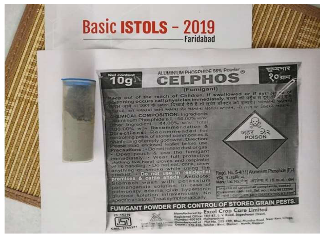
Fig. 10: Grey coloured cement powder simulating celphos powder of Aluminium phosphide We have similarly conducted another ISTOLS on 7th April 2018 in SMIMSSikkim Manipal Institute of Medical sciences, Gangtok, Sikkim successfully by training 37 resident doctors in critical care, emergency, forensic medicine and toxicology, pharmacology, internal medicine and NRHM Rural Medical Officers posted in peripheries of Sikkim State.