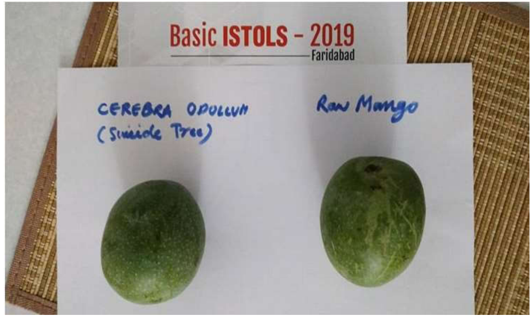
Fig. 11: Raw mango (from Garden) simulating look alike, Cerbera odollam suicide tree fruit.

Fig. 10: Grey coloured cement powder simulating celphos powder of Aluminium phosphide We have similarly conducted another ISTOLS on 7th April 2018 in SMIMSSikkim Manipal Institute of Medical sciences, Gangtok, Sikkim successfully by training 37 resident doctors in critical care, emergency, forensic medicine and toxicology, pharmacology, internal medicine and NRHM Rural Medical Officers posted in peripheries of Sikkim State.