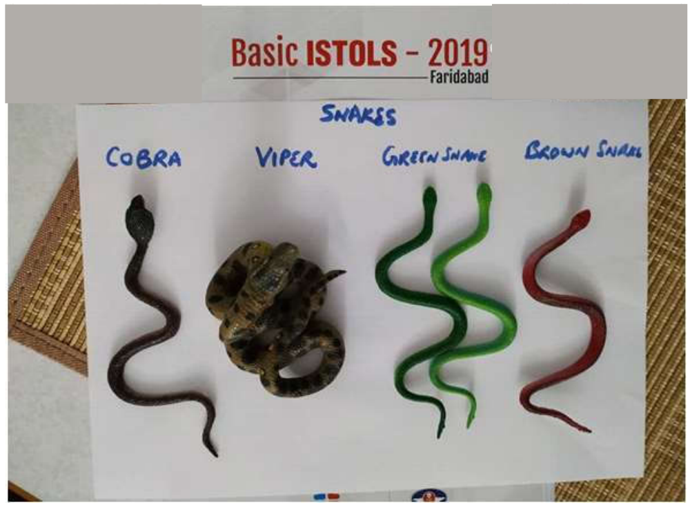
Fig. 6: Different Venomous Snakes for identifying 4 Toxidromes, by big 4, Cobra and Viper, and non-venomous Green Snake, Brown Snake; utilising look alike toys, thus learning Toxicology in non-toxic manner