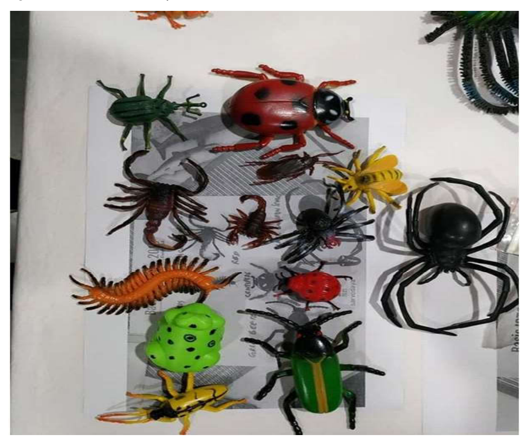
Fig. 3: Poisonous animals (Dart Frog) Venomous insects (Black widow spider, Scorpion, Red scorpion, Honey Bee, Wasp, Spanish Fly, Centipede, Tarantula), non-venomous (Common Spider, Cockroach, Red Beetle) of rubber used for simulation training including beetle, spider, scorpion and dart frog. Thus learning Toxicology in non-toxic manner.

On 21st November 2019, Similarly, we conducted ISTOLS in Grande Internationale Hospital, Kathmandu, Nepal successfully by training 34 resident doctors and consultants in critical care, emergency, forensic medicine and toxicology