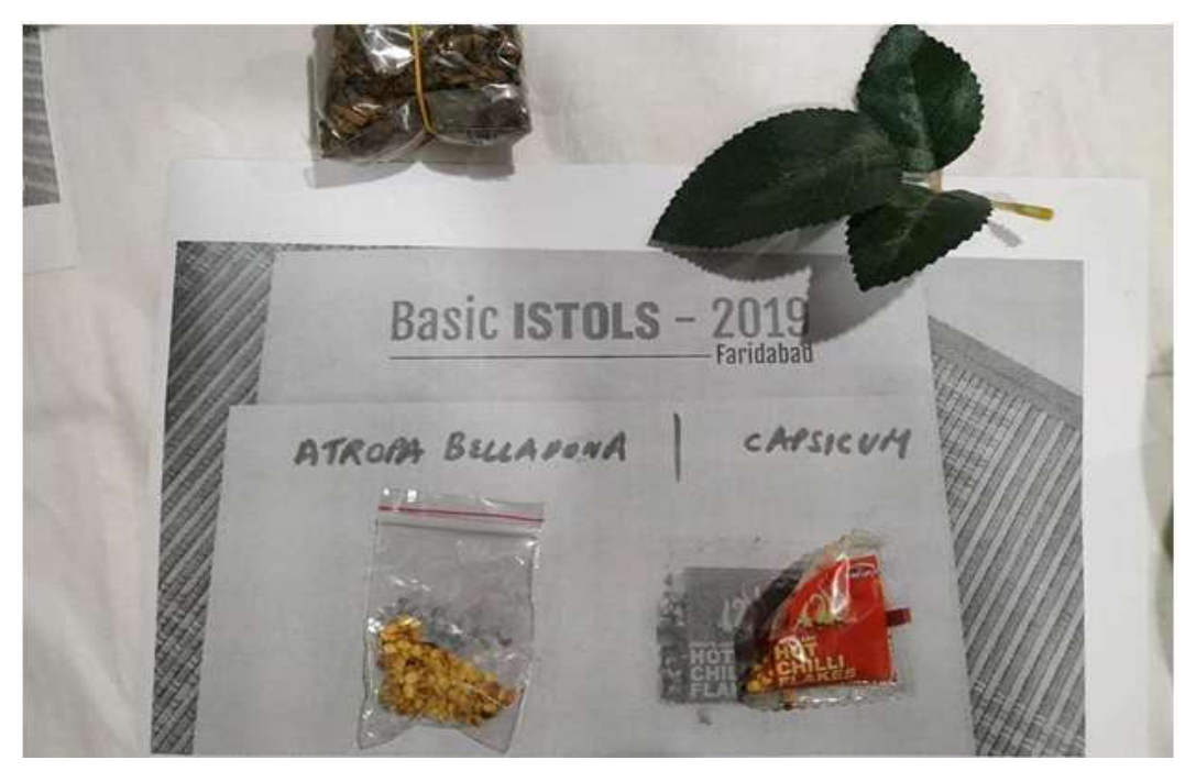
Fig. 2: Dhatura seeds simulation by chilli seeds.