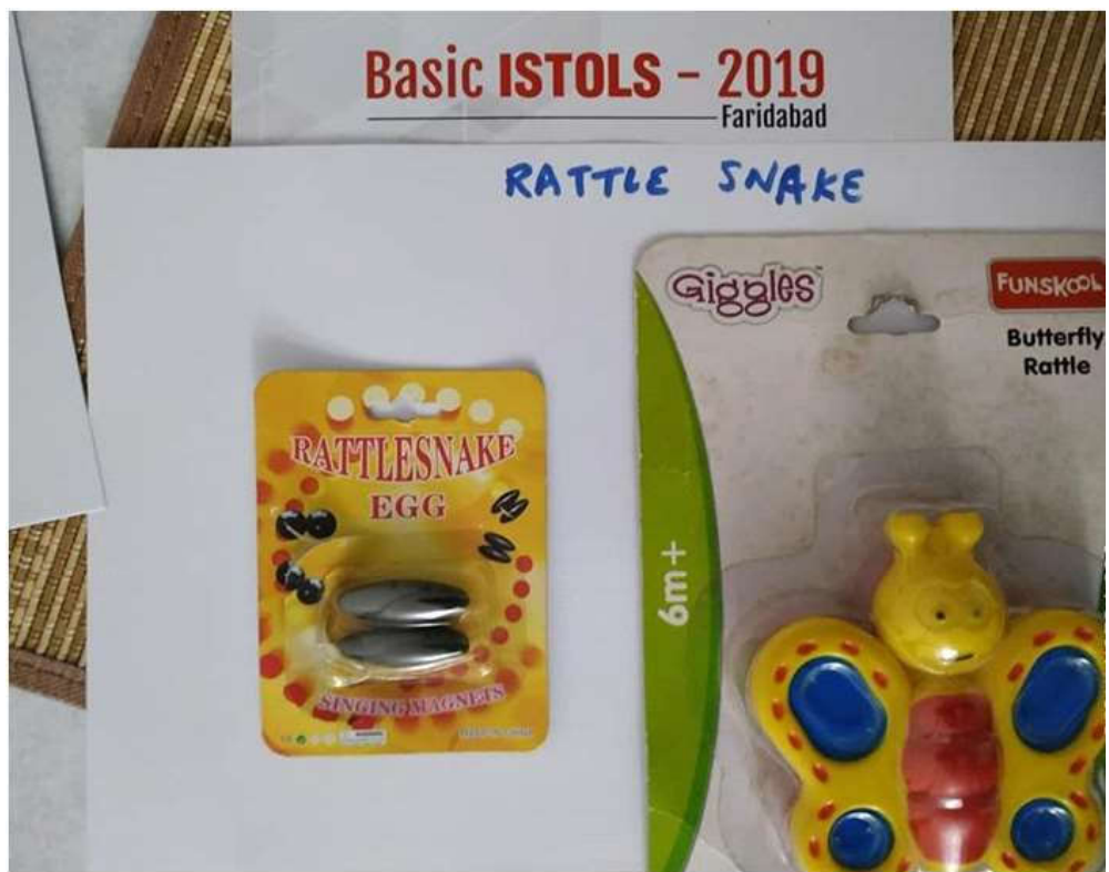
Fig. 7: Simulating rattling sound of rattle snake by colliding magnetic pellets and differentiating with death rattle in victim, simulated by rattle toy sound.

On 23rd March 2019, in Amrita Institute of Medical Sciences (AIMS), Poison control centre, Kochi, we have Bottom figure 7. Caption, add space to the bottom para below on page 71medicine and toxicology. conducted ISTOLS workshop successfully by training 25 resident doctors, NRHM Rural Medical Officers of Kerala and consultants in critical care, emergency, forensic medicine and toxicology.