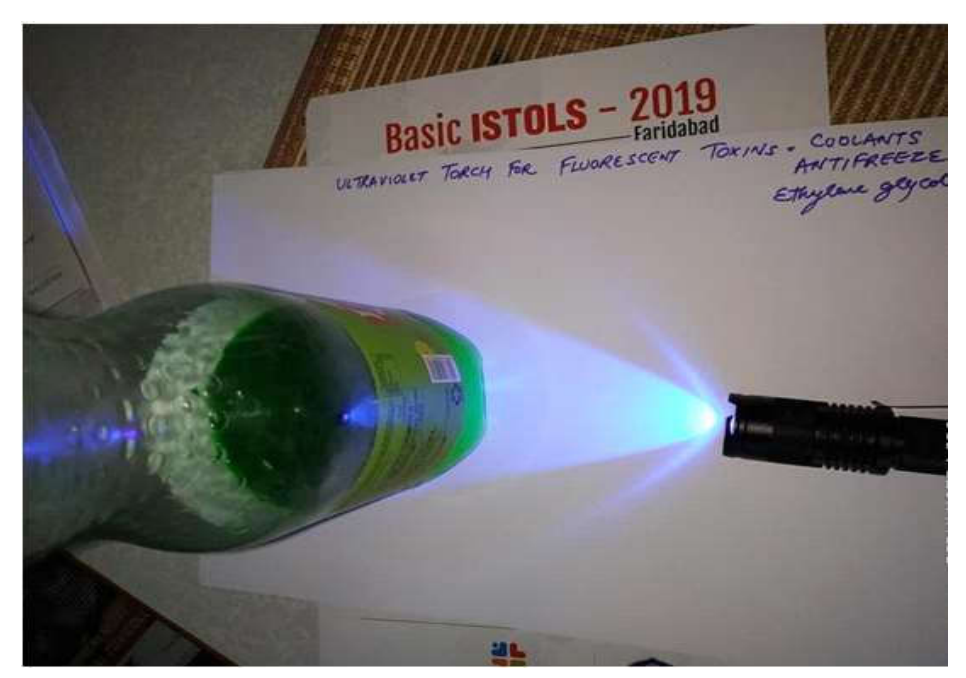
Fig. 9: Ultraviolet fluorescence of Car AC coolant- ethylene glycol- toxic alcohol (glows in UV torch) for on-spot diagnosis Last year, we have conducted ISTOLS on 24th-25th June 2018 in Medanta-the Medicity successfully by training 21 resident doctors, NRHM Rural Medical Officers of Haryana and consultants in critical care, emergency, forensic medicine and toxicology.

On 13th January 2019, in Victoria Hospital, Bengaluru, we have conducted ISTOLS workshop successfully by training 55 resident doctors, NRHM Rural Medical Officers of Karnataka and consultants in critical care, emergency, forensic medicine and toxicology.