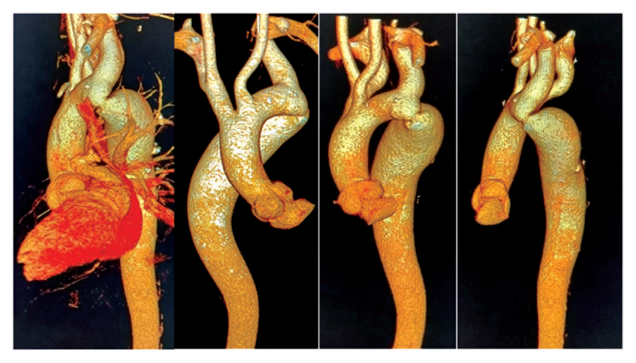
Coarcted segment and Post stenotic dilation

Coarcted segment is seen after the origin of left subclavian artery with post stenotic dilation. Collaterals are seen draining into the descending aorta.