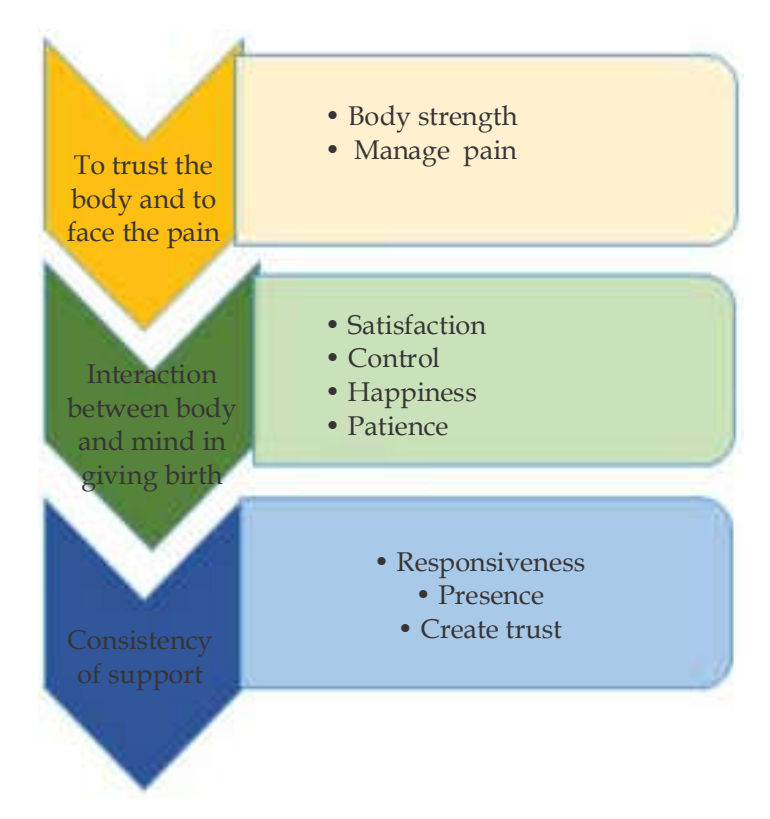
Fig. 5: Categories and sub categories for a positive birth experience.

Mother have some kind of choices such as:place of birth, care provide, what foods to avoid, prenatal testing, eliminating all caffeine, alcohol, how much and what kind of exercise, Safe travelling etc.<sup>13</sup> and Mother have some kind of choices such as: Choice in decision making, Efficacyof pain control, Social support, Control own feelings and Some kind of medical interventions etc. And one main theme