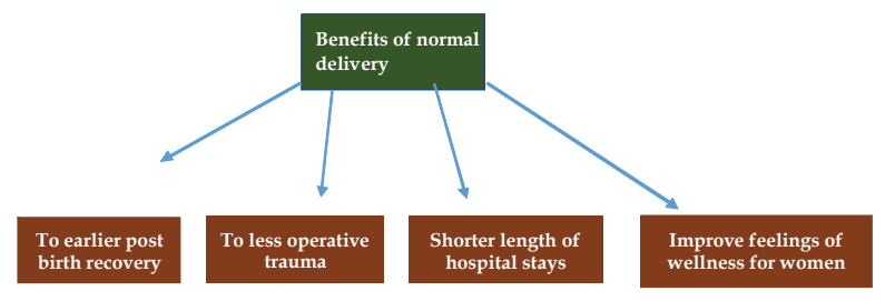
Fig. 1: Benefits of normal delivery

Recently German study initiate that women preparation an out-of-hospital vaginal birth (it may be homebirth and birth centre) had a 77.81% success rate in comparison to in-hospital vaginal birth of 32.1% in the same province. Overall the study concluded that outside of hospital vaginal delivery was harmless where there were properly capable midwives and clear risk showing principles. Most of the women chose normal delivery because it has