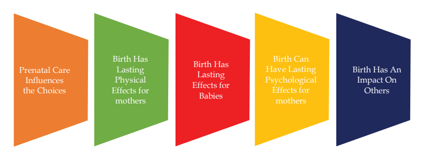
Fig 4: 5 ways to affect parenting

these basics to both a more value of experience outcomes and upgraded. Choice is an action, which involvesclose connections between purpose and wisdom, profits and risks gathering of first choice created on their efficacy. It is possible to propose that because consequences during gravidity anddelivery are undefined, that female may reflect choice not only to be around wishes for a firm birth skills but also a casual. <sup>10</sup>