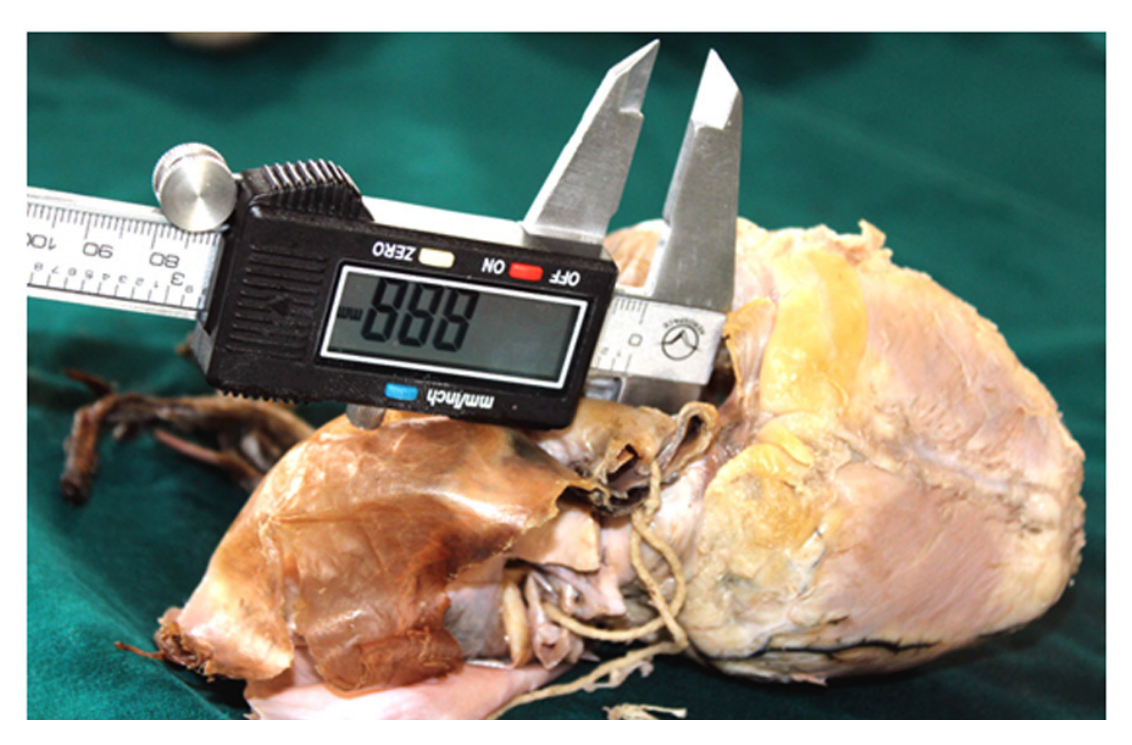
Fig. 3: Use of Vernier Calliper for measuring the width of the atrial septal defect

At about sixth to seventh week a cresent shaped thicker ridge appear in the roof called septum secundum between left venous valve and septum primum. It extends till it covers the ostiumsecundum. The lower crescent shape of this forms the sharp rim covering superior, anterior and posterior border of fossa ovalis in adults.