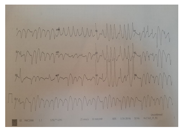
Fig. 2: Intractable VT in patient X

ECG: (Obtained post Initial Resuscitation) Ventricular Tachycardia (Showing evolution and Intractability with ACLS 2020 Management) (Fig. 1 & 2):