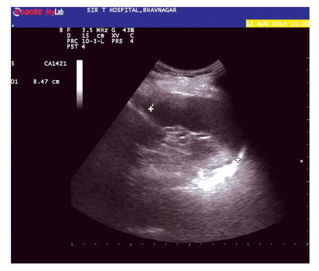
USG IMAGE showing measurement of splenic Length

Graph 1: Splenic length in relation to Height in both sexes