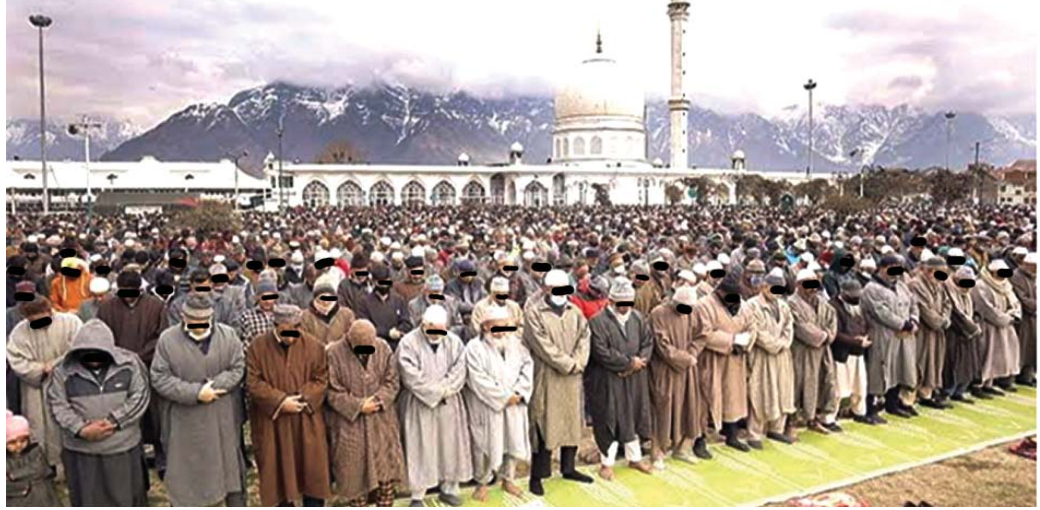
Indian Journal of Waste Management / Volume 7, Number 1/January - June 2023