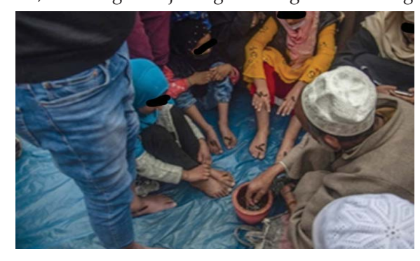
Indian Journal of Waste Management / Volume 7, Number 1/January - June 2023

Leeches produce an anticoagulant and literally suck blood from the surface of skin, they are frequently used to revive delicate veins and improve blood flow following a tissue reattachment method. In Kashmir Leech therapy is an old tradition that has been practiced and this practice remains widespread in many other parts of the world such as Iran, Ancient Egypt, India, the Arabian Peninsula, and Greece, among others. In Kashmir, it is practiced since long and usually done on the particular day of Nowruz, which marks the beginning of the new year on the Persian calendar. It is observed that apart from treating people on Nowruz, the practitioners gather every Friday in Dargah and practice this age old therapy. Kashmiris believe that the significance of taking leech therapy heals all skin ailments such as skin diseases, dental problems, nervous system issues, inflammation, and chilblains. It has become a routine for every Friday when the Hakeem/practitioners converge at Dargah to practice leech therapy for their livelihood. When placed on certain parts of the body, leeches begin their work by sucking the impure blood from a patient's body. They have three jaws with tiny rows of teeth with which they pierce a person's skin, inserting or injecting anticoagulants through