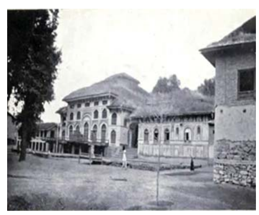
Hazrat Bal The Mosque

was constructed between 1968 and 1979 under the supervision of J & K Muslim Auqaf Trust's Sheikh Mohammad Abdullah. Besides being the most revered shrine in Kashmir, Hazratbal was used by the National Conference for political gains also. The architectural style of the Hazratbal Masjid can be described as Islamic. It is built in white marble and has a large white dome and tall minarets on the