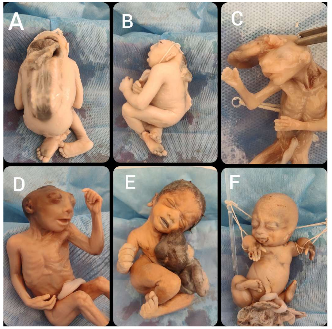
Fig. 1: Gross photograph of Spina bifida (A and B), Exencephaly (C), Anencephaly(D), Omphalocele (E) and Phocomelia(F)

On categorizing the anomalies into system wise involvement, central nervous system (CNS) was most common involvement followed by Table 1: System wise distribution of cases