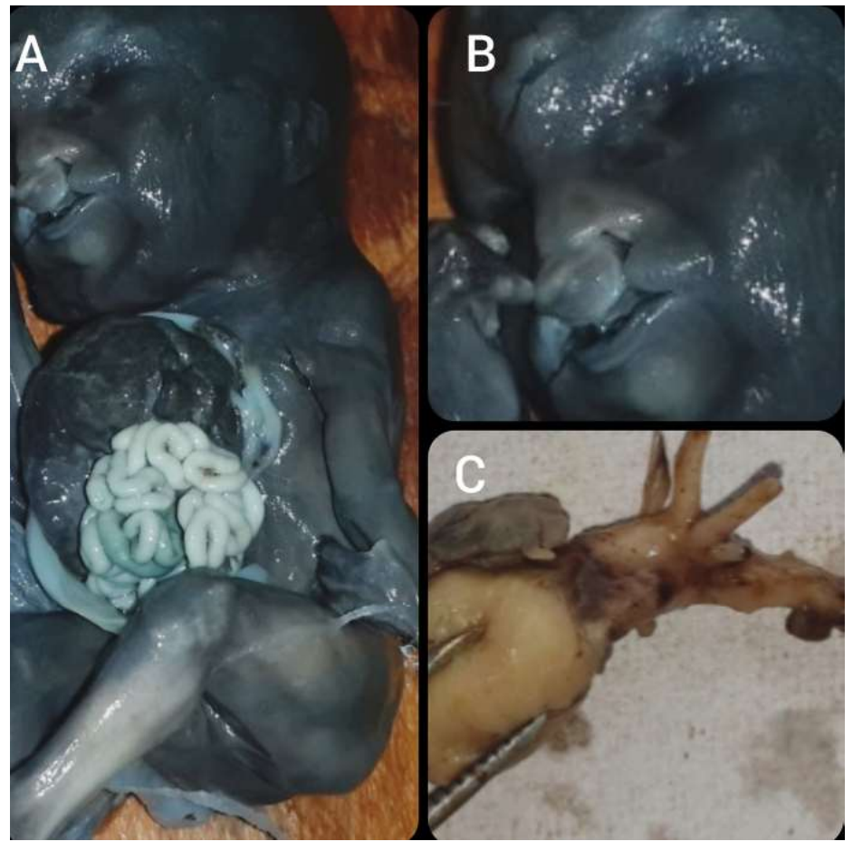
Fig. 3: (A) Gross photograph of Patau syndrome omphalocele with protrusion of liver and intestine coils, (B) cleft lip and cleft palate, (C) Coarctation of aorta

diagnosis of Down syndrome and Patau syndrome (Fig. 3) was made using the combined results of a USG and a histopathological examination and confirmed by karyotyping results.