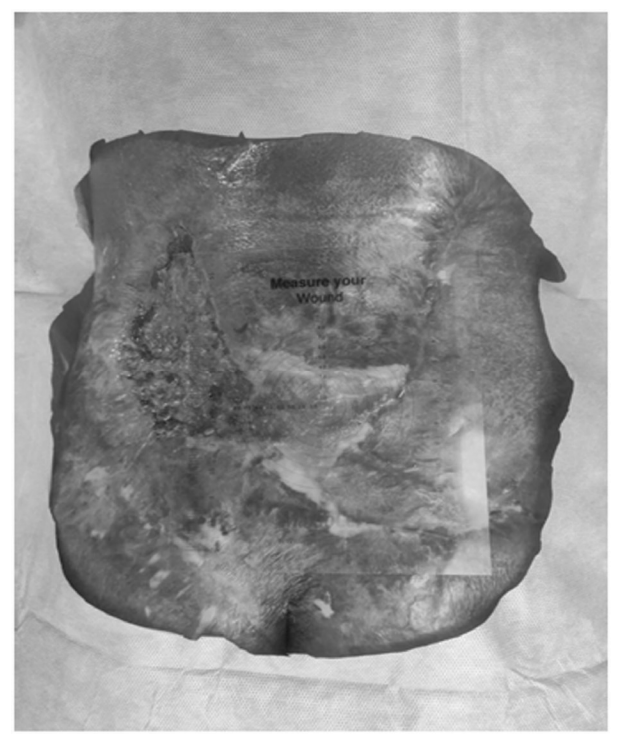
Fig. 2: Measurement of the wound with the stencil

Wound measurement is an important step in its management. Wound measurement gives an idea for deciding the current treatment efficacy and for changing the current treatment. There are various methods by which wound can be measured like photographic record, comparison, ruler method, graph method, digital planimetry.<sup>2</sup> The stencil scale used in our study is found to be useful in assessing the 2-Dimensional size of the woundas it easy to measure the area of the wounds as it is transparent.