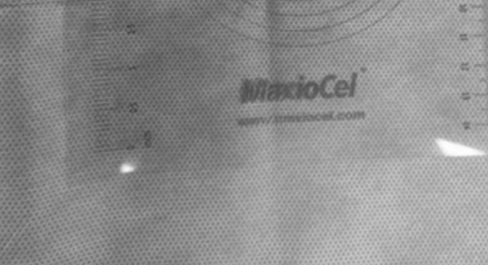
Fig. 1: Stencil for wound assessment

routine investigation, the patient underwent a CT Dorsolumbar scan to rule out osteomyelitis. The ulcer on the back was excised and sent for histopathology to rule any malignant aetiology. After ruling out malignancy, patient underwent transposition flap for the raw area post excision. Post transposition distal part of the flap underwent necrosis for which debridement was done. The raw area post debridement was planned for further procedures for wound cover. The raw area was measured with the help of stencil (figure 2) with the markings in the X and Y axis and circular markings in the stencil will help in measuring thecircumference of the irregular wound. The cost of the stencil is 200 Indian rupees easily available in all stationeries in Indian market.