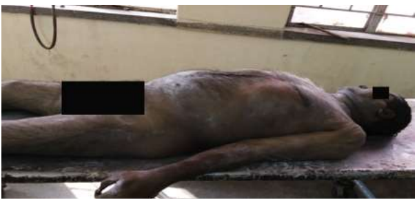
Fig. 3: The human cadaver after two days of injecting the raw formaldehyde the fluid absorbed

formaldehyde resulting in irritation of the mucous membranes of eyes and nose. But in the present world when donated dead bodies are extremely rare so to simply throwing it away is not ethically correct. But I suggest if necessary go for APR full face masks and do the procedure.