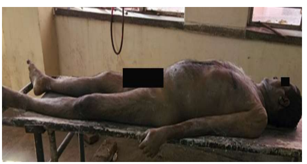
Fig. 2: The human cadaver after injecting the raw formaldehyde

Note: I rather not suggest to go for such methods as it posses direct exposure to the Raw