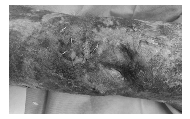
Fig. 3: Wound Post-operative Day 10 key stone flap.