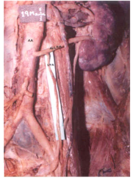
Fig. 3: Double renal arteries (RA1, RA2) seen on the left side with a distance of 4.2 cm between the origin of two arteries from abdominal aorta (AA)

According to Bayramoglu et al., the variations in the number of renal arterial divisions in the hilar region are generally associated with renal malformations in the embryo [16].