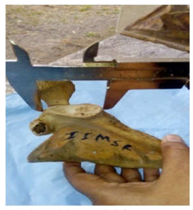
Fig. 2: Photograph showing method of measuring superiorinferior Diameter of glenoid cavity

glenoid border and the most prominent point of the supraglenoid tubercle [Figure 1]. II) Anterior-Posterior glenoid diameter (B) is the maximum breadth of the articular margin of the glenoid cavity perpendicular to the glenoid cavity height [Figure 1]. III) Anterior-Posterior glenoid diameter (C) is the anterior-posterior diameter of the superior half of the glenoid cavity at its mid-point (Figure 1). All these measurements were taken in millimeters using sliding digital vernier caliper (Figure 2).