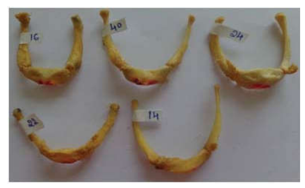
Fig. 1: Different shapes of hyoid bone.