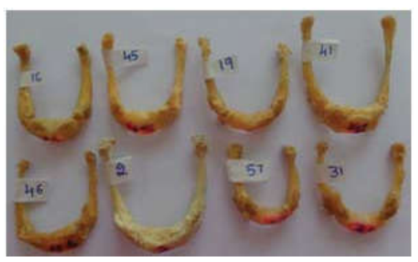
Fig. 2: 'U' Hyperbolic shape.

Modern sex determination techniques originated in traditional physical anthropology, even today initial assessment of sex is based on visual gauze of the width of the pubic bone and the subpubic angle or greater sciatic notch. However, since the pelvis