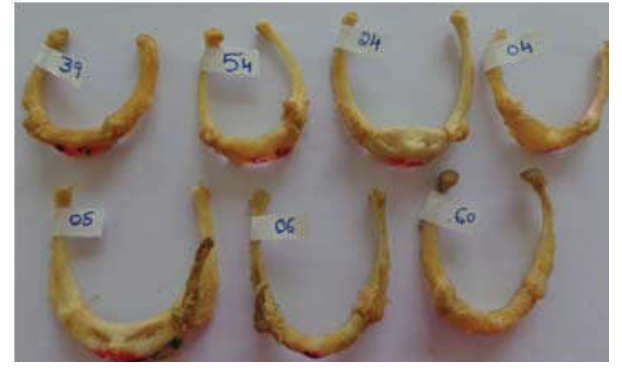
Fig. 5: 'H' – Horse shoe shape.

least common is 'V' shaped type (6.66%) as shown in table 1.