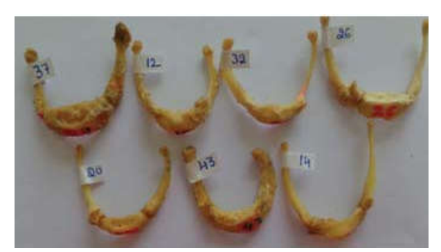
Fig. 6: 'D'- Deviated type.

is not always available, intact or 100% diagnostic, more options were needed. ^{\rm 11}