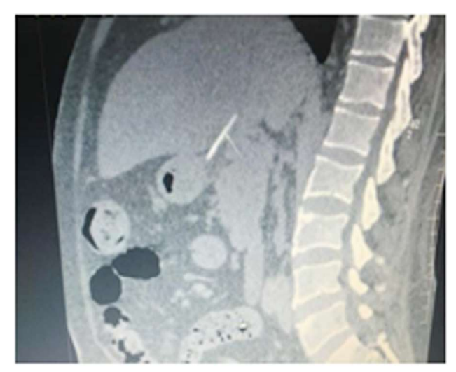
Fig. 1: Linear density in Liver

He was given antibiotics and taken up for surgery. Laparoscopic Liver abscess drainage and a foreign body -3.5 cm fish bone was noted within the abscess, which was removed. Patient improved clinically and was doing fine on follow up.