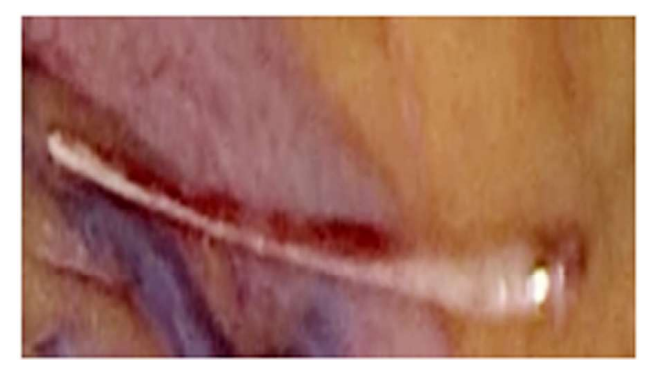
Fig. 4: Fish bone