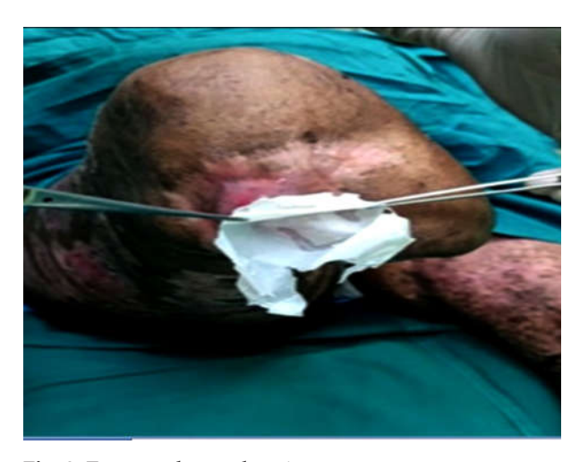
Fig. 9: Egg membrane dressing