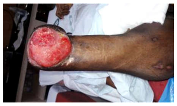
Fig. 3: Post Amputated stump - Unhealthy Raw area