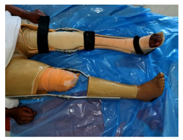
Fig. 10: Patient with splint at the time of discharge