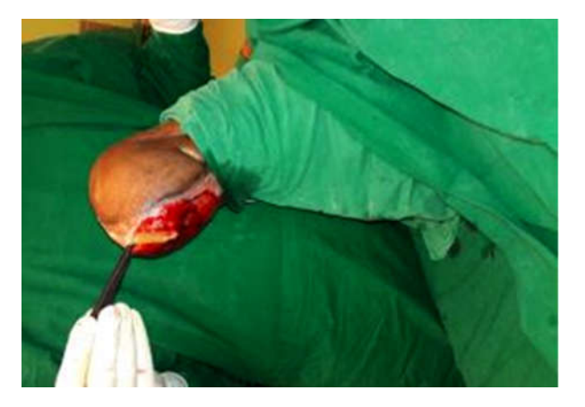
Fig. 6: PRFM - Platelet rich fibrin matrix applicationer