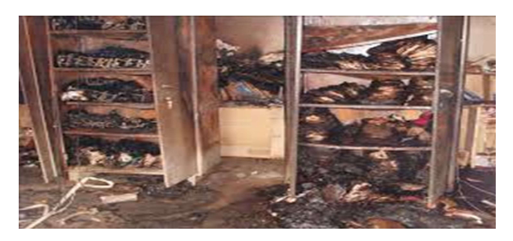
Figure 2: Showing the charred documents found at the scene of crime