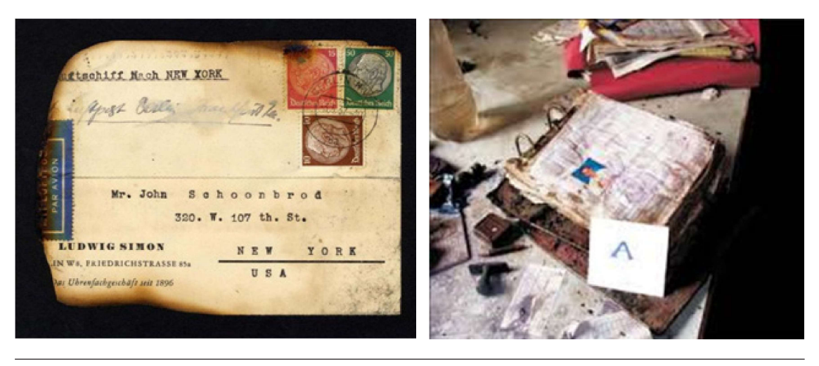
Figure 1: Showing a sample of some of the charred documents

charred documents are supposed to be found, at crime scene, their handling and all the related information up to their forensic examination & the tools and techniques have been reviewed in this paper.