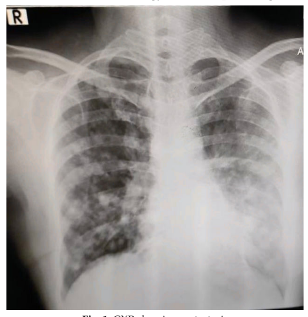
Fig. 1: CXR showing metastasis

Her CT lung showed¹ Multiple round well circumscribed soft tissue attenuated lesions of variable size noted in bilateral lungs, largest one measuring 14*13mm² Collapse consolidation of lingular segment of upper lobe. Her CT brain shows¹ Heterogenous lesion in the left occipital region with perilesionaloedema,² Mass effect in the form of effacement of the left lateral ventricle and midline shift towards right side for a distance of 8mm³ Small area of gliosis in the right appearance. Saturation was 90% on room air. After discussing with obstetrician, oncology team temporal region.