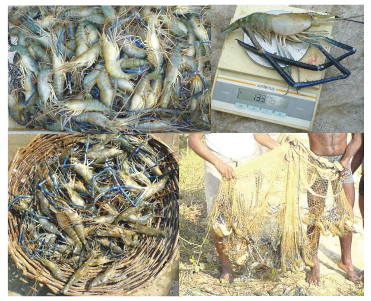
Indian Journal of Agriculture Business / Volume 1 Number 1 / January - June 2015