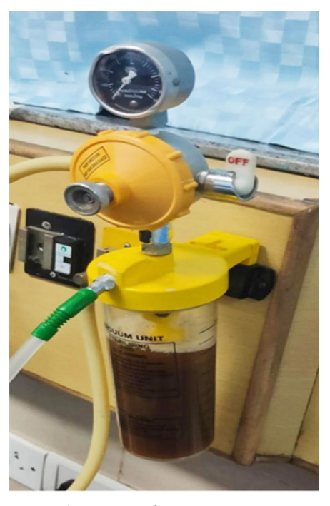
Fig. 3: 1.5 L of Gastric Content