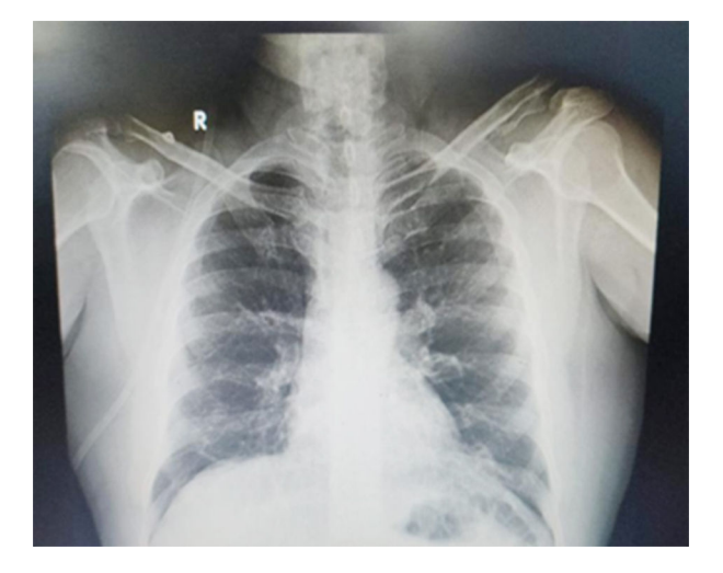
Fig. 2: Chest X-ray