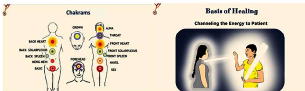
Fig. 3: Chakram of the energy body

internal organs as well as to the respective Chakrams of the energy body which distribute the given energy to the energy body and physical body.