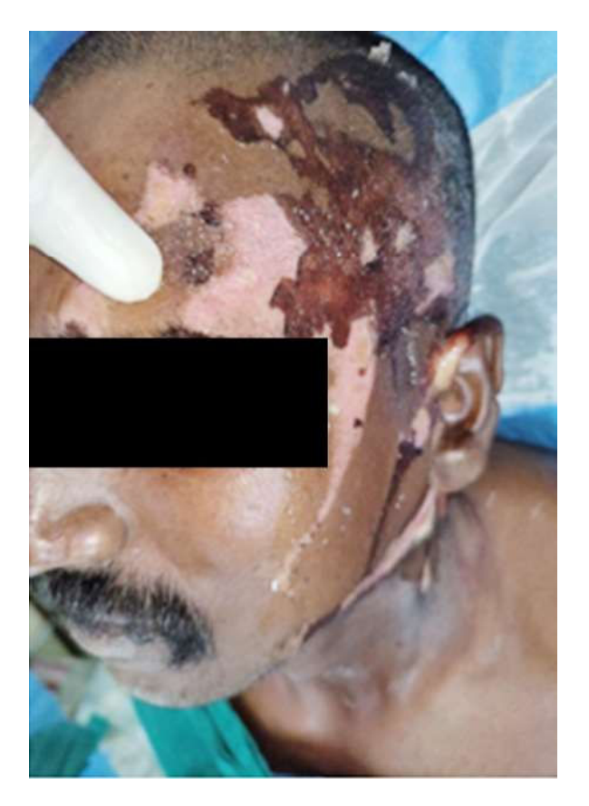
Fig. 2: Application of aloe vera gel over burn scald wounds.

100 g gel. Aloe Vera is widely and easily available gel in Indian markets.