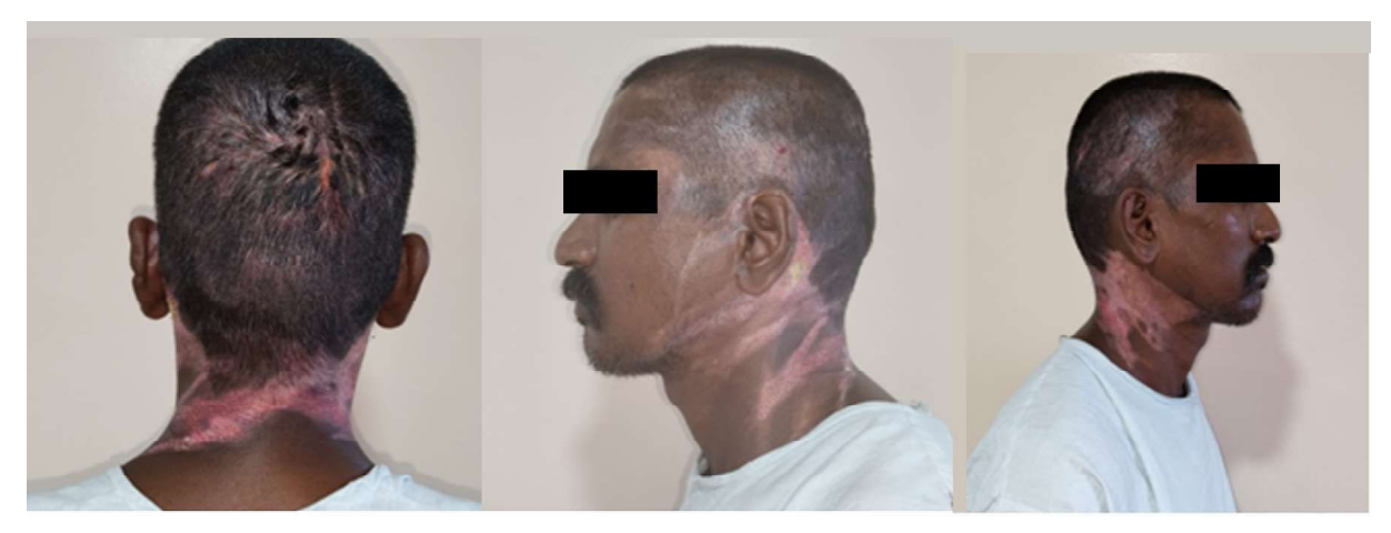
Fig. 3: Healed burn wound at day 14

14. (Fig. 3) No adverse effects noted with aloe vera. Wounds healed with less scarring. Patient discharged successfully.