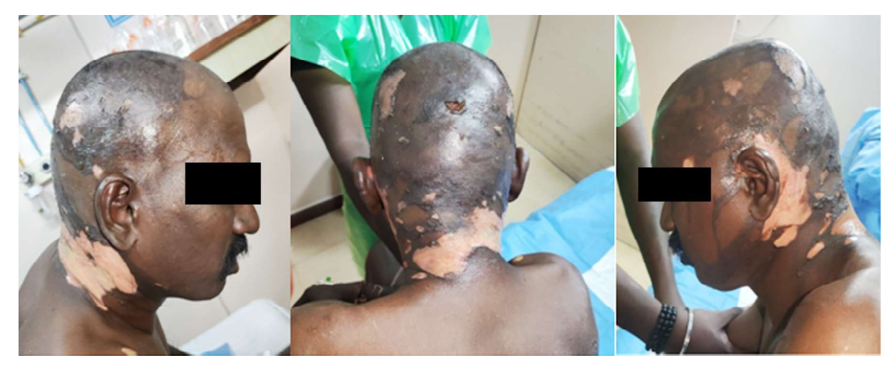
Fig. 1: Scald burn wound at admission

debridement, regenerative therapies in the wound. We applied aloe vera gel over the burn wound from day 1 and during every dressing change.