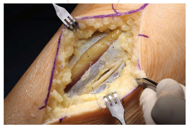
(M) extensor digitorum longus

fat landmark superficial fascia (incised)