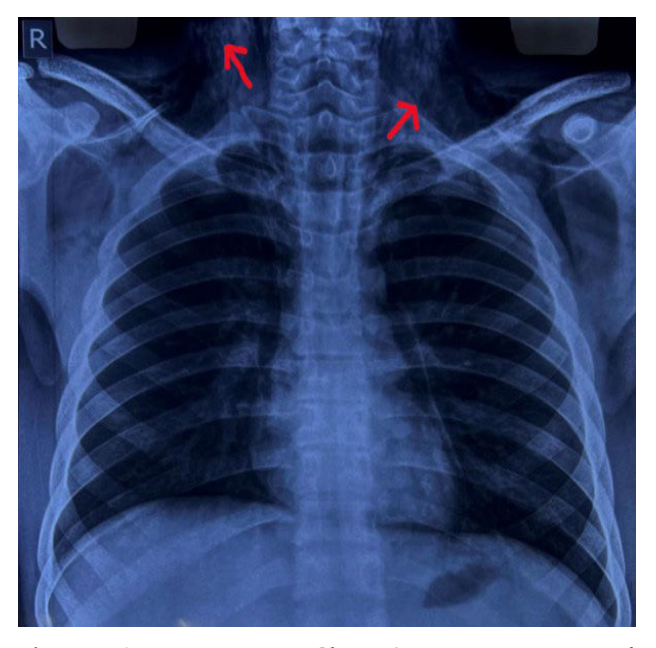
Fig. 1: Anteroposterior Chest X-Ray Demonstrated Subcutaneous Emphysema in the Soft tissue of the Neck

Laboratory values (complete blood count, renal function test, electrolytes) and arterial blood gas were within normal limits. His electrocardiogram (ECG) was normal. Urgent X-rays of the chest showed bilateral Subcutaneous Emphysema in the lower part of the neck and upper chest with minimal pneumomediastinum (Fig. 1).