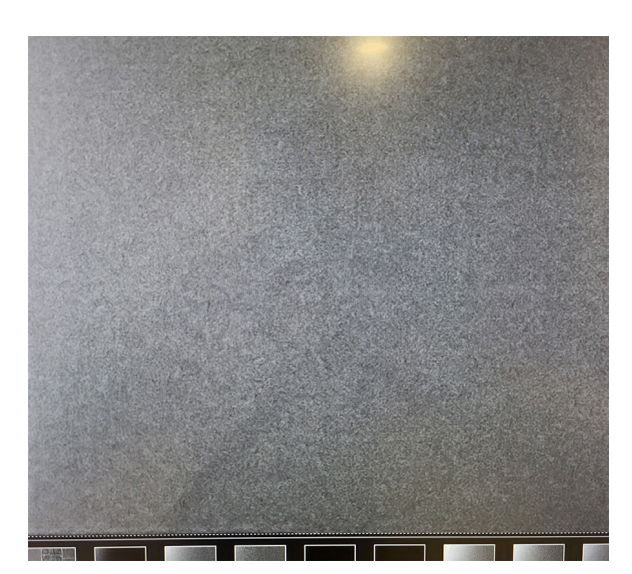
Fig. 2: Fluroscopic Lateral View - Blurred due to High Body Mass Index