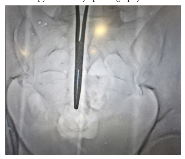
Fig. 1: Fluoroscopic Position And View Anterior-Posterior

Epidural injections of local anaesthetic agents and corticosteroids are widely used to provide symptomatic relief in patients with low back pain due to lumbar radiculopathy.<sup>3</sup> These injections can be approached by trans laminar, transforaminal, and caudal routes. Caudal epidural injection is considered as semi-invasive procedure and allows sufficient proximal spread of medicine Fluoroscopy is most commonly used in interventional spine procedures and is frequently used in confirming the location of tranforaminal and caudal epidural needle.<sup>4</sup> It has been advocated that caudal epidural needle placement should be confirmed by fluoroscopy alone or by epidurography.<sup>5</sup>