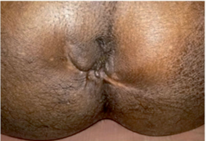
8<sup>th</sup> months after healing