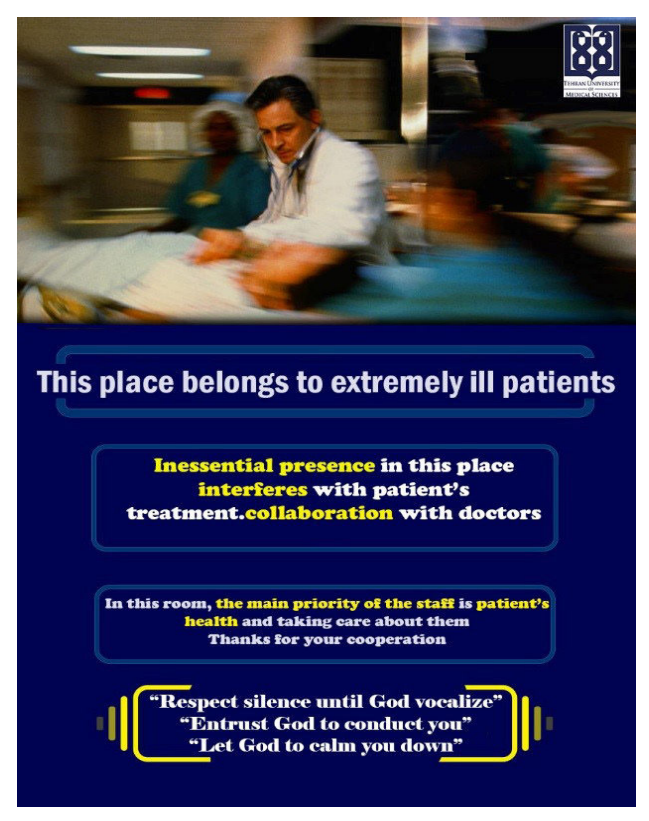
Fig. 3: Rehabilitation Room Poster

The most frequently mentioned location for quarrels was the triage room at which we placed several posters in order to concentrate on. Patients' referral to the nurse station to ask about IV fluids and other related matters and also the rate of complaints about different services were not reduced significantly according to our results (P-values= 0.953, 0.450, 0.973 for the related questions). Overall, the patients' awareness of emergency problems such as overcrowding and shortages of manpower and equipment, increased after the intervention based on general ideas of the personnel in the later interviews; however, this information has not been documented in the results.