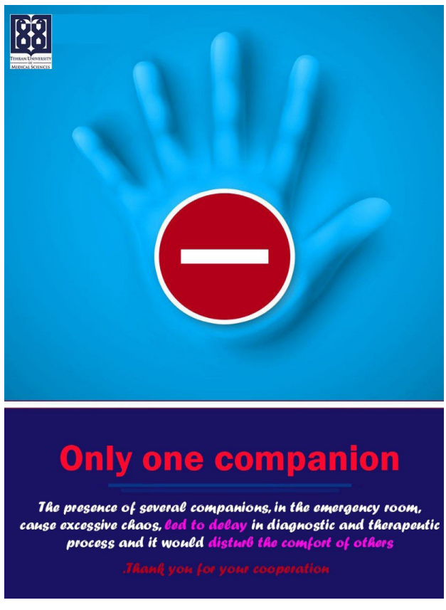
Fig. 1: Poster related to the arrival of the patient's companions in the emergency room.