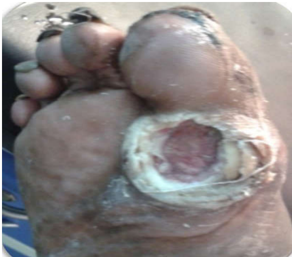
Fig. 10: Shukla varna Vrana.

Ulcers with whitish discoloration are found in Candida associated gastric ulcer, peptic ulcer, tubercular ulcer. (Fig. 10)