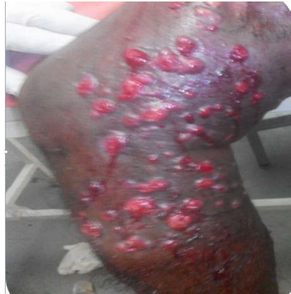
Fig. 15: Vrana with bloody discharge.

Bloody discharge is a customary feature observed in the ulcer necessitating the quick therapeutic measures to check the same. (Fig. 15)