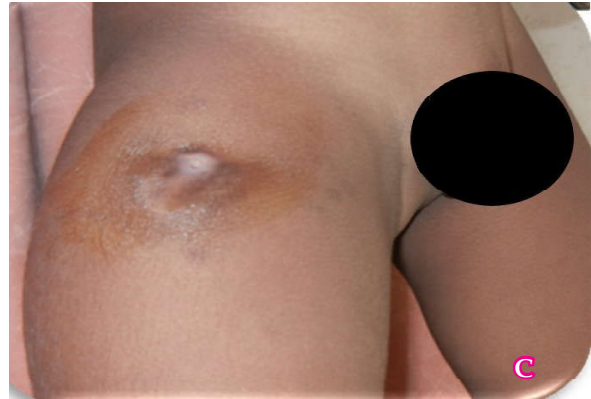
Fig. 3: Ati Samvruta Vrana.