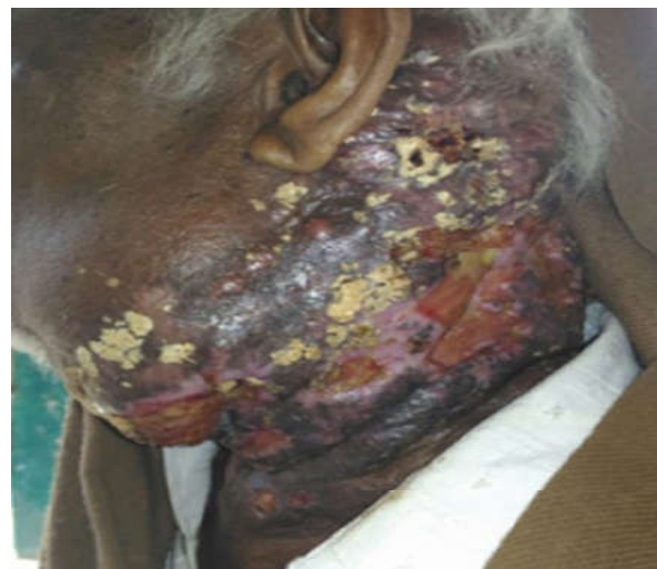
Fig. 20: Vrana associated with shotha.