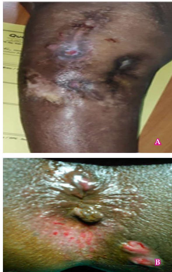
Fig. 18: Utsangi - Unmargi vrana

Dalhana commenting on this delineate the word Unmargi as Tiryak gati which means, an ulcer with penetrating or invasive nature. Invasive spread of the ulcer destroying the healthy tissues is appreciable in Tubercular, malignant ulcers and sinuous tracts. The other examples are Shambookavarta bhagandara, ushtragriva bhagandara. (Fig. 18).