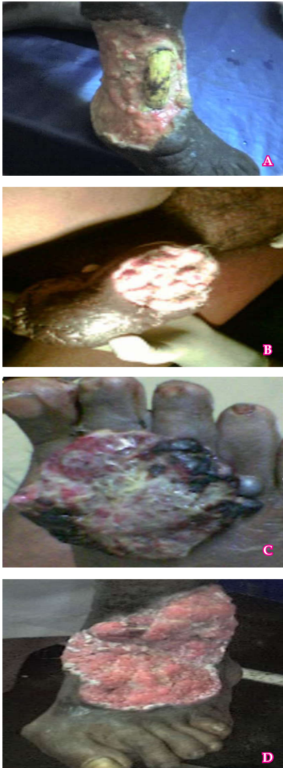
Fig. 17: Horrifying look of certain Vrana.

is sickening like in basal cell carcinoma, Marjolin ulcer, basal cell epithelioma. (Fig. 17)