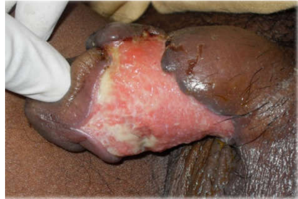
Fig. 6: Ati Mridu Vrana.

Mridu means soft due to Kapha, pitta and rakta dosha, there are various ulcers which are very soft on palpation. The best suited examples are ulcers of genitalia - fournier's gangrene, soft chancre and ulcers of the mouth etc. (Fig. 6)