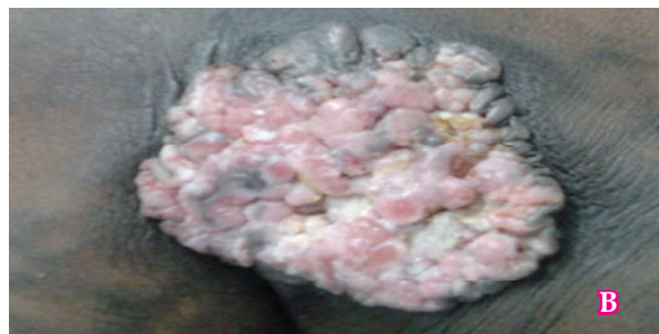
Fig. 12: Utsanna Vartma.