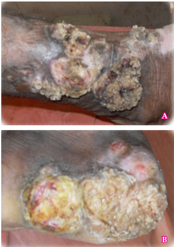
Fig. 5: Ati Kathina Vrana.

Kathina means hard or solid or indurated due to Vata dosha and appreciable on palpation, there are certain wounds which are very hard to touch as in cases of Actinomyces or in chronic non healing venous ulcers or ulcer in the Elephantiasis. (Fig. 5)