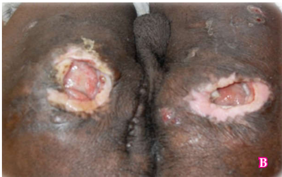
Fig. 13: Avasanna vartma.