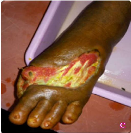
Fig. 4: Ati Vivruta Vrana.