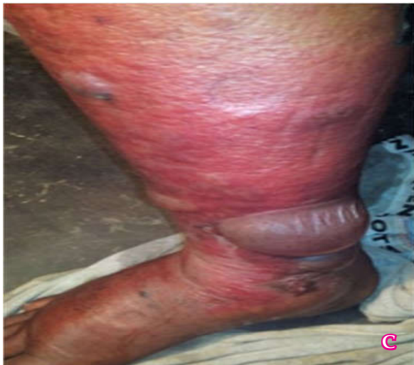
Fig. 19: Vrana associated with Paka