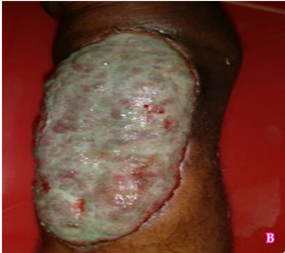
Fig. 9: Peeta varna Vrana.