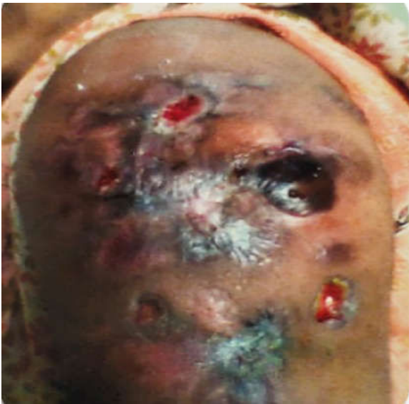
Fig. 21: Pidakayukta vrana.