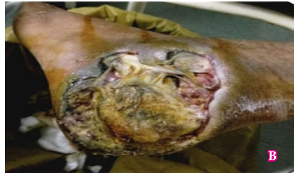
Fig. 11: Vrana with indistinguishable colour.