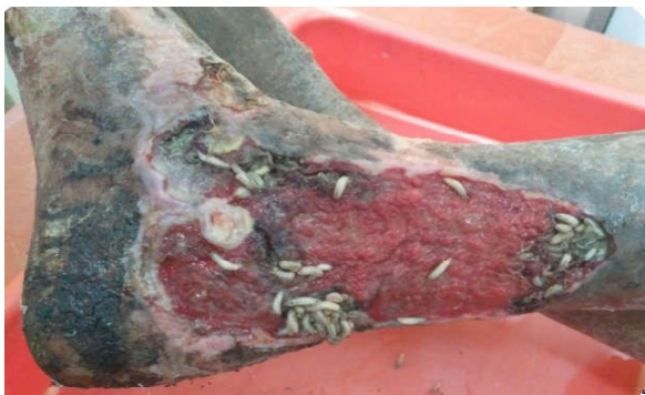
Fig. 14: Vrana afflicted with Krimi (Maggots).

Invasion of micro or macro organisms into the wound is observed in Dushtavrana by which the local doshic imbalance aggravates resulting in extensive tissue damage and also initiation of systemic complications. (Fig. 14)