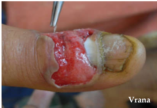
Fig. 1: Stage of Vrana formation. Classification of Vrana.