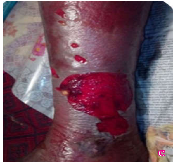
Fig. 7: Krishna varna Vrana.