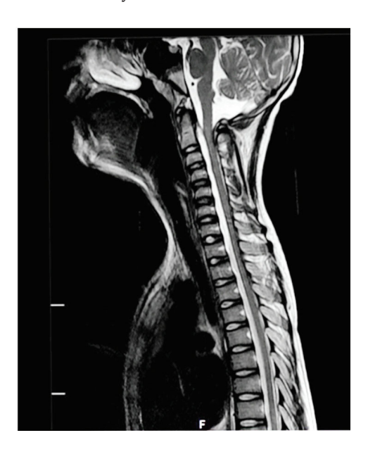
Fig. 1: MRI Sagittal view showing anterior epidural collection with layering extending from C2 to D8 level causing posterior displacement and compression of cervical and dorsal cord likely due to haemorrhage.

and temperature of 99 degree F. Single breath count (SBC) was.<sup>8</sup> General examination revealed deep icterus. Cardiovascular examination and chest auscultation were unremarkable and abdomen was soft. On neurological examinationhe was conscious, irritablebut obeying commands. Pupils were bilateral 2mm reacting to light,no nystagmus, normal fundus, no facial weakness and other cranial nerves examination was grossly normal. He was unable to lift his neck against gravity, power in all 4 limbs was grade 1/5 with hypotonia and deep tendon reflexes were absentwith extensor plantars. Sensory level was appreciated at T5/T6 level and patient had urinary retention.