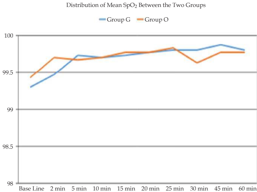
Fig. 3: Line diagram showing comparison of mean SpO 2 in Group G and Group O